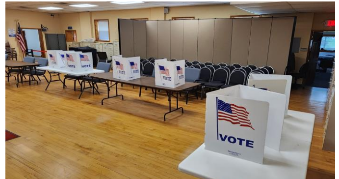
The meeting room/courtroom in the Hurley Town Hall was converted into a polling place for the June 27 primaries.